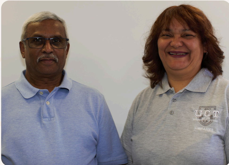
Local organising leads

Oversight Committee Chair and Local Organising Committee Chair